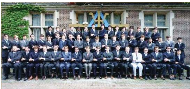
Photo of St. Anthony Hall brothers taken in back of Delta chapter house, 3637 Locust Walk, Philadelphia, PA.