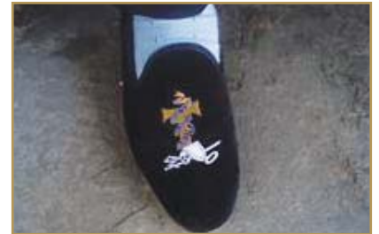
Celebratory sartorial splendor, St. Anthony Hall style.